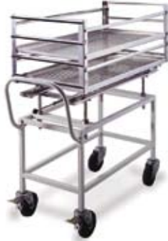
Loading Cart & Transfer Carriage