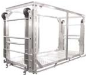
Drop Wheel Loading Cart (DWLC)