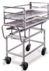
Loading Cart & Transfer Carriage (LC/TC)