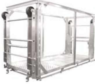
Drop Wheel Loading Cart