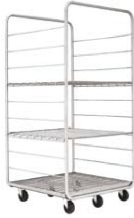
Floor Loading Cart