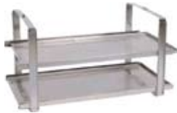
Rack & Shelves (RS)

All Tuttnauer loading equipment is manufactured from high quality stainless steel material. We offer several different options in order to accommodate our various model lines. Please reference the chart below to determine which piece of loading equipment is available for each chamber size. Special designs can be provided upon request.