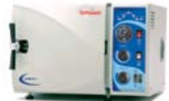
Manual Table-Top Autoclaves

Tuttnauer USA Co. 25 Power Drive, Hauppauge, NY 11788 Tel: +800 624 5836, +631 737 4850 Fax: +631 737 0734 E-mail: info@tuttnauerUSA.com