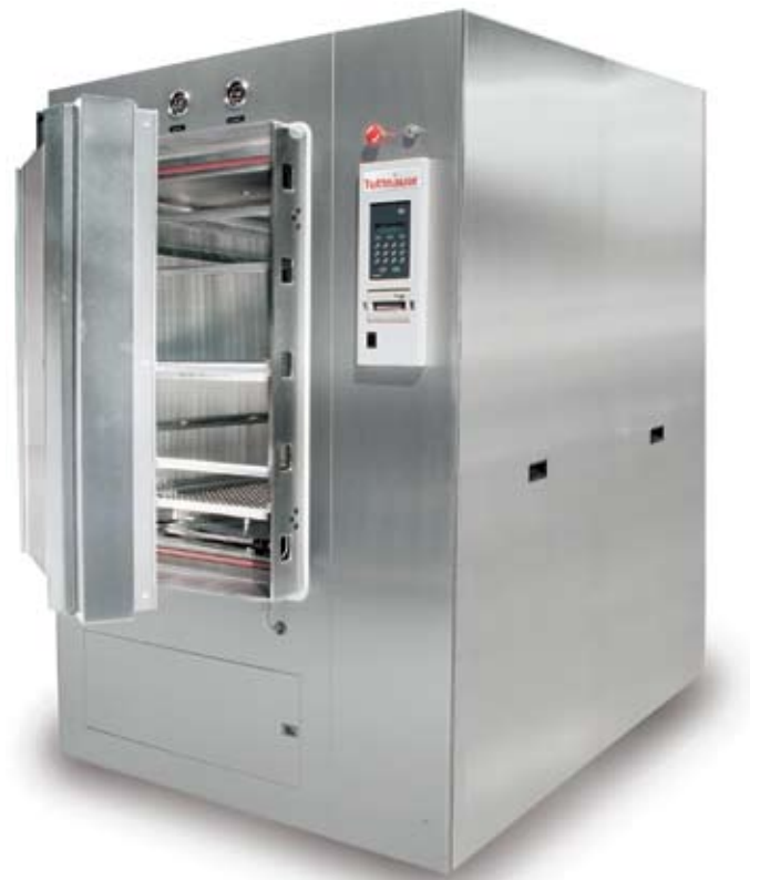
Automatic Hinged Door