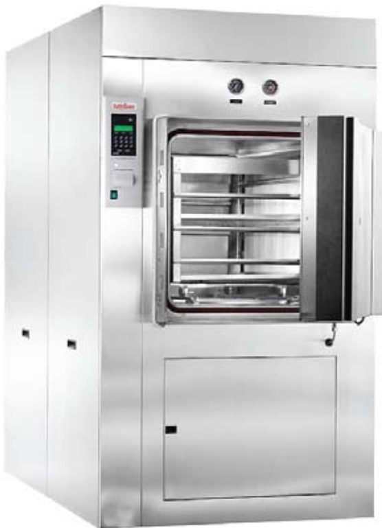
Automatic Hinged Door