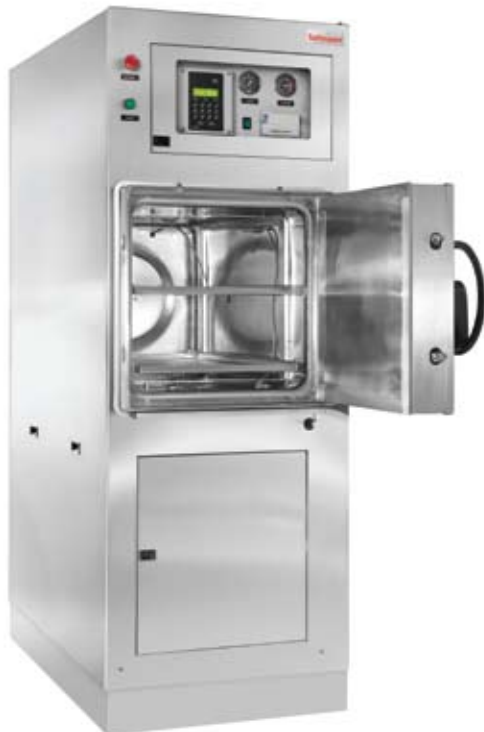
Manual Hinged Door