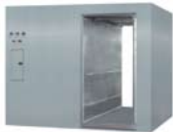
Bulk Steam Sterilizers for Laboratory & Scientific Applications