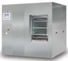
Horizontal Steam Sterilizers for Laboratory & Scientific Applications

Featuring Tuttnauer's range of cleaning, disinfection and sterilization solutions