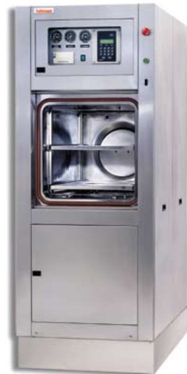
Vertical Sliding Door