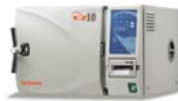
Fully Automatic Table-Top Autoclaves