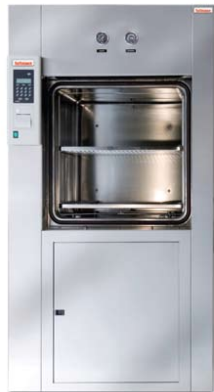
Vertical Sliding Door