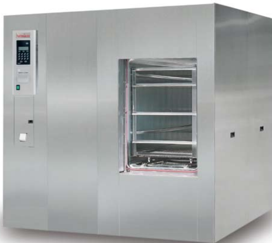
Horizontal Sliding Door